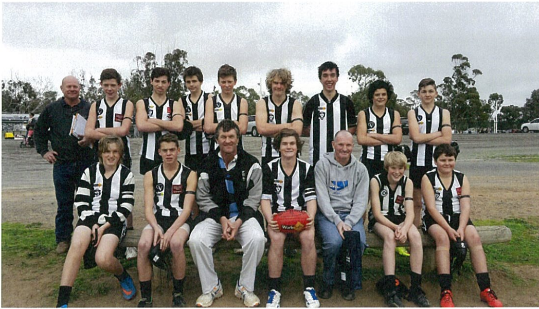
U16 2015 TEAM