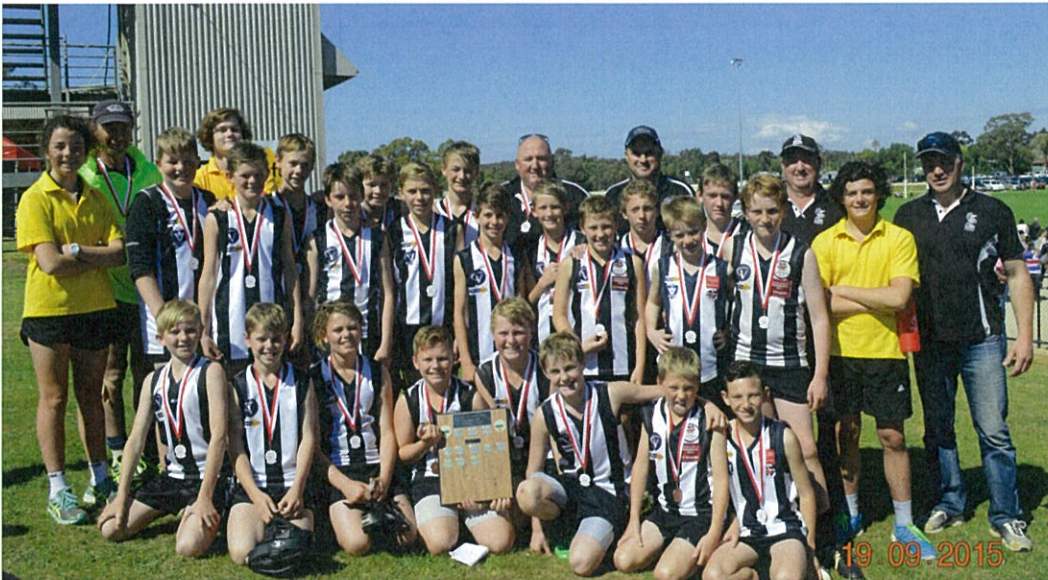
U13 2015 NCFL PREMIERS

Our Junior Club would like to thank all our club's weekly & trophy sponsors for the 2015 Season their assistance was greatly appreciated. The clubs aims this year were to provide a supportive environment for our members where their skills and knowledge of football could be nurtured. The icing on the cake for our Junior Club this year was the U13 Premiership, a just reward for all the hard work by the boys. The experience & enjoyment of this day will stay with the boys for a long time