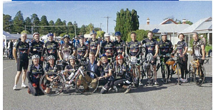
Members of the 2015 team at the finish line

Boort District Health www.bdh.vic.gov.au www.murraytomoyne.com.au