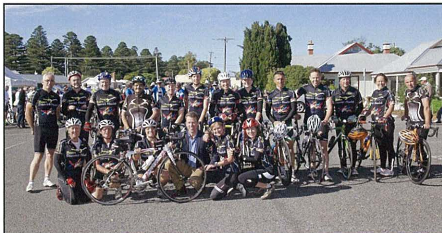
2015 BDH team