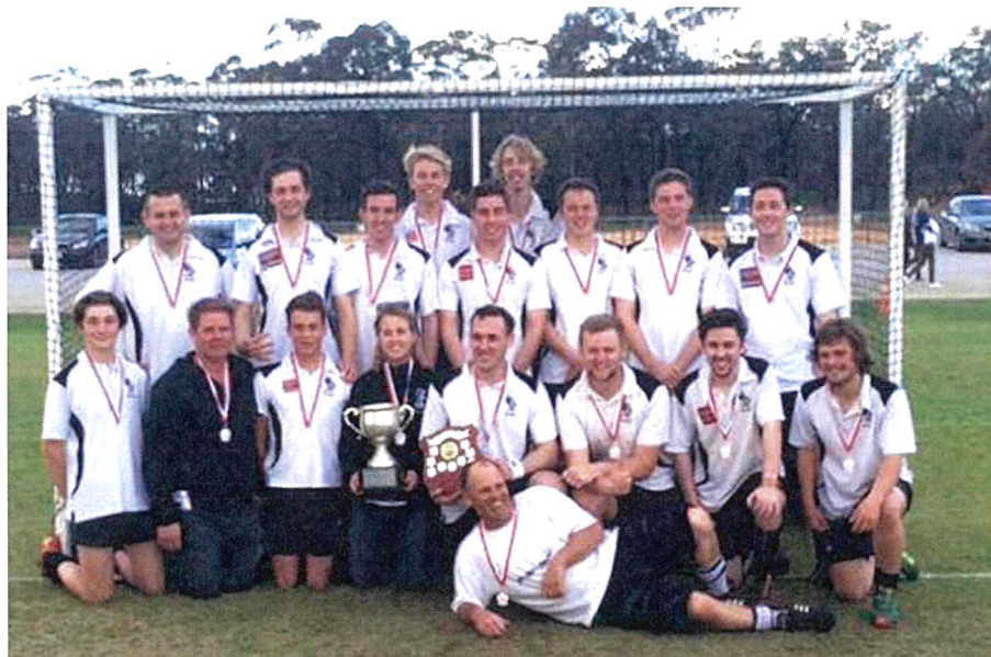
Winners are grinners ... Boort Mens Hockey are Premiers after Saturday's Grand Final