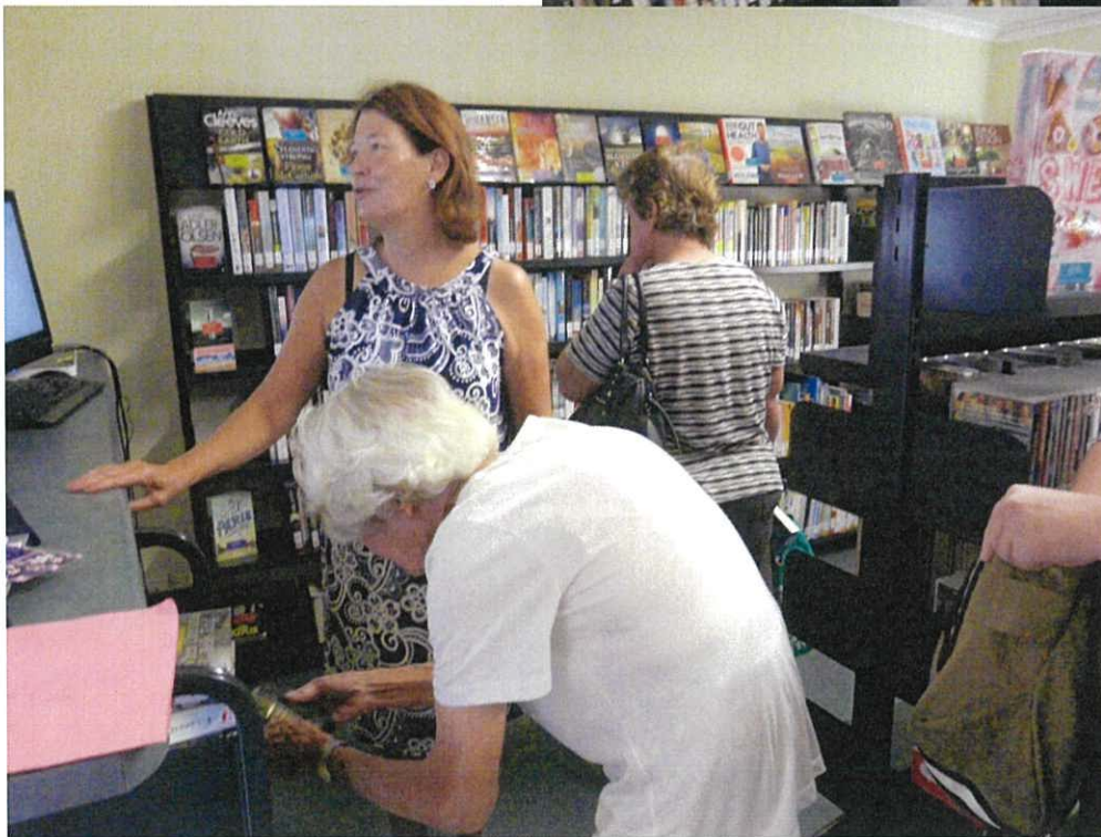
Librarian from Goldfields Library assisting borrowers on the first day of operation of the agency