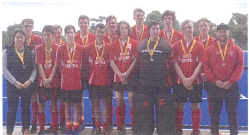
Under 17 Boys

All teams made a commendable effort and three of the teams Under 15 Boys, Under 17 Girls and Under 17 Boys made the final of their respective competitions. However, this time they were successful in achieving the silver medal leaving the gold as something to chase in the future. Great effort by all competing teams. More details inside.