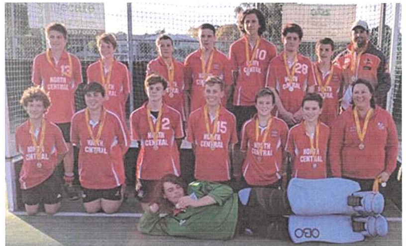
Under 15 Boys

Local Boort hockey players were represented in the North Central junior hockey teams that competed in Melbourne last weekend.