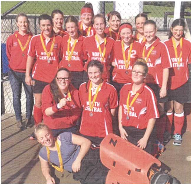
Under 17 Girls