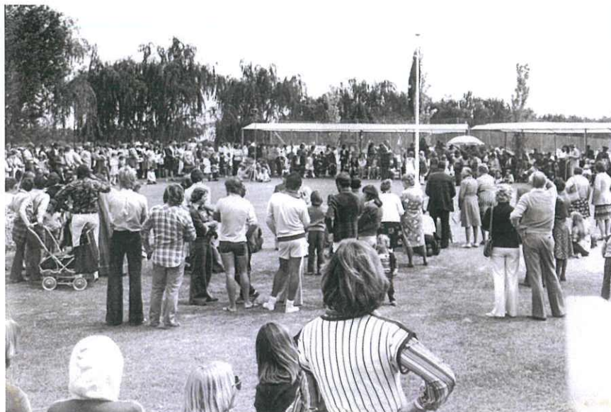
Not so sleepy town Boort Australia Day circa 1980-1990

At a quarter to one a male relative was sent out to reconnoitre and he returned with tidings of dismay. The bridegroom having filled himself up with beer and valour, had ridden over on a cart-horse to the bride's residence and proposed to her youngest sister, who was neither lame nor red-headed and they had been married half-an-hour previously at the rival church with the damaged small brother as best boy and a crowd of excited clodhoppers as witnesses. Then arose a scream that rent the heavens and the eldest bride lost her balance and hit out at every angle, also she rent her attire and oscillated violently. She was conveyed home on a dray and put to bed in a darkened room where she still remains and her days and nights are now devoted to planning a fearful vengeance on her sister and her sister's husband and the small boy who aided and abetted them in the abyss of their depravity. But as yet she is too feeble to go out and ride upon the storm and the judgement which is to rush down upon the three conspirators is consequently postponed.