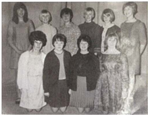
A Grade 1967

The North Central Hockey Association began competition in 1965 and as Boort was one of the founding clubs, it is also the 50 year anniversary of Boort Hockey Club.