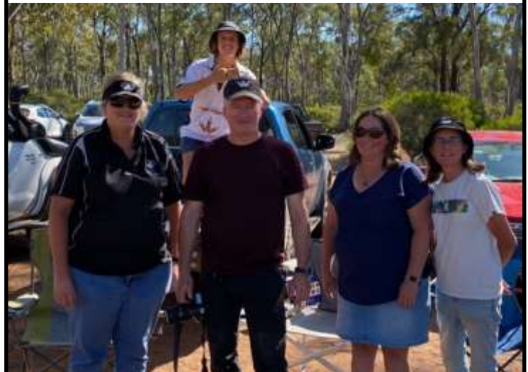
Celebrity visit on the day

You can still donate towards Boort-Yandos Cricket shed at the Go Fund Me website.