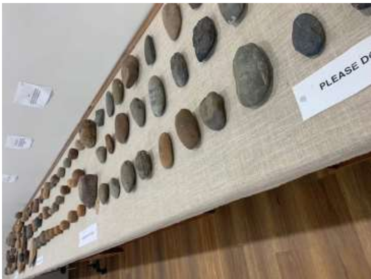
Photo is part of a very large collection of Artefacts presented by Farmers in the district.

The Keeping place also grows native foods, specialising in Acacias (Wattles) for human consumption, you can