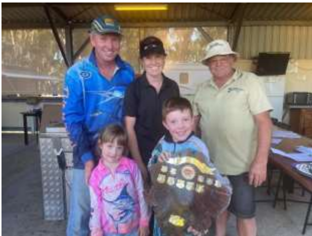
Some of the BAC Members with MMNAAC Shield