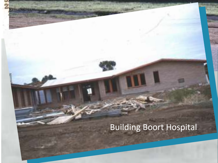
Building Boort Hospital