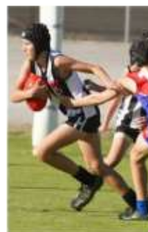
MOST CONSISTENT COOPER GOODING