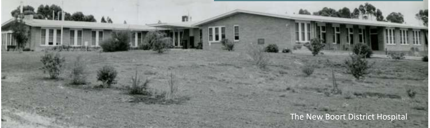
The New Boort District Hospital