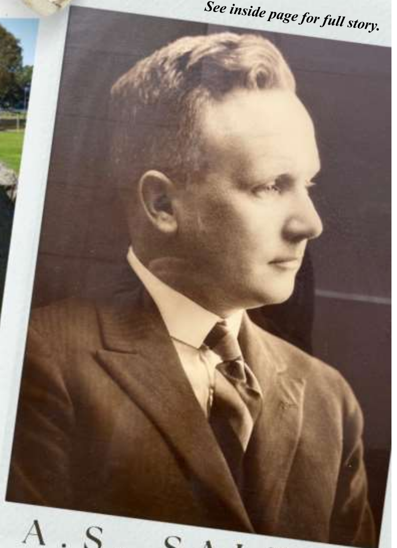
See inside page for full story.