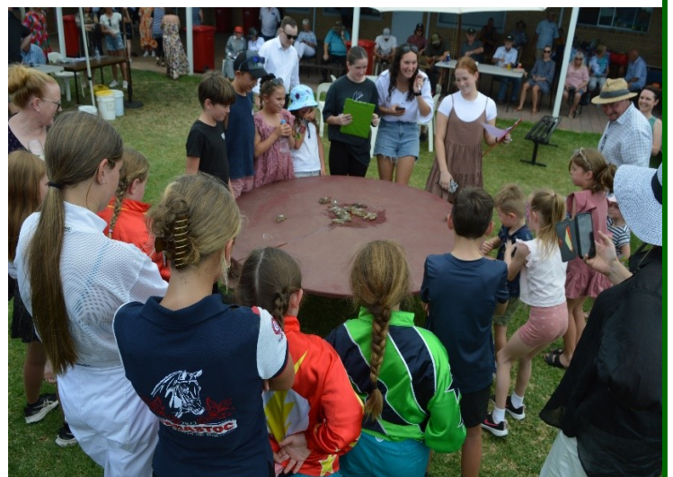
Boort District School kids taking part in a Yabby race