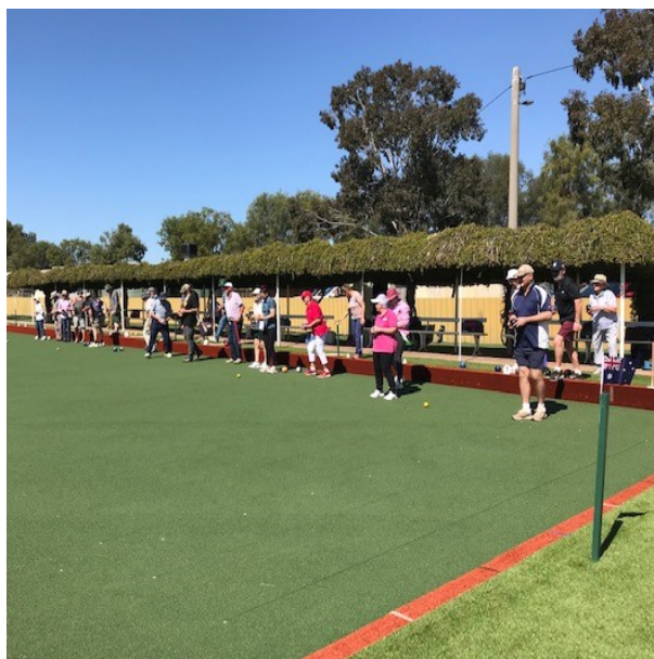
Players preparing for their roll to the envelope