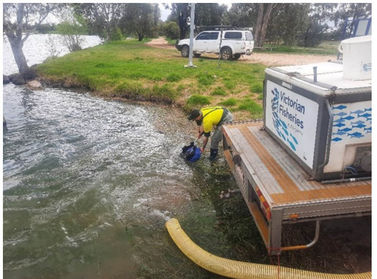
VFA Officer releasing trout at Tchum Lake

On Sat 28th Oct & Sun 29th Oct, there will be another comp on the west side of the Loddon River at the junction of the Waranga Western Channel.