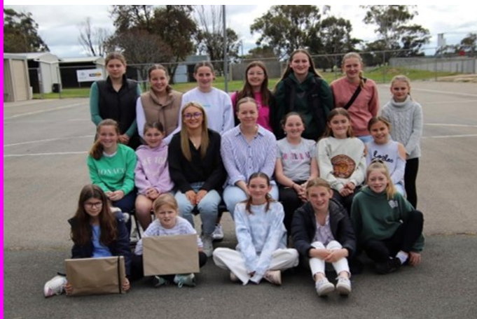
Under 14's team of 2023