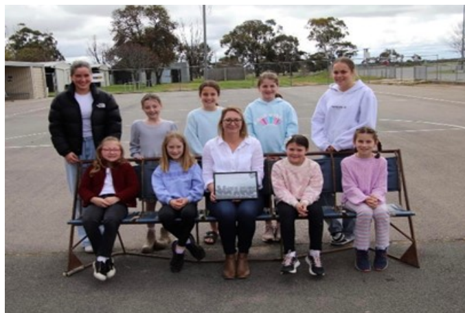
Go Team 2023