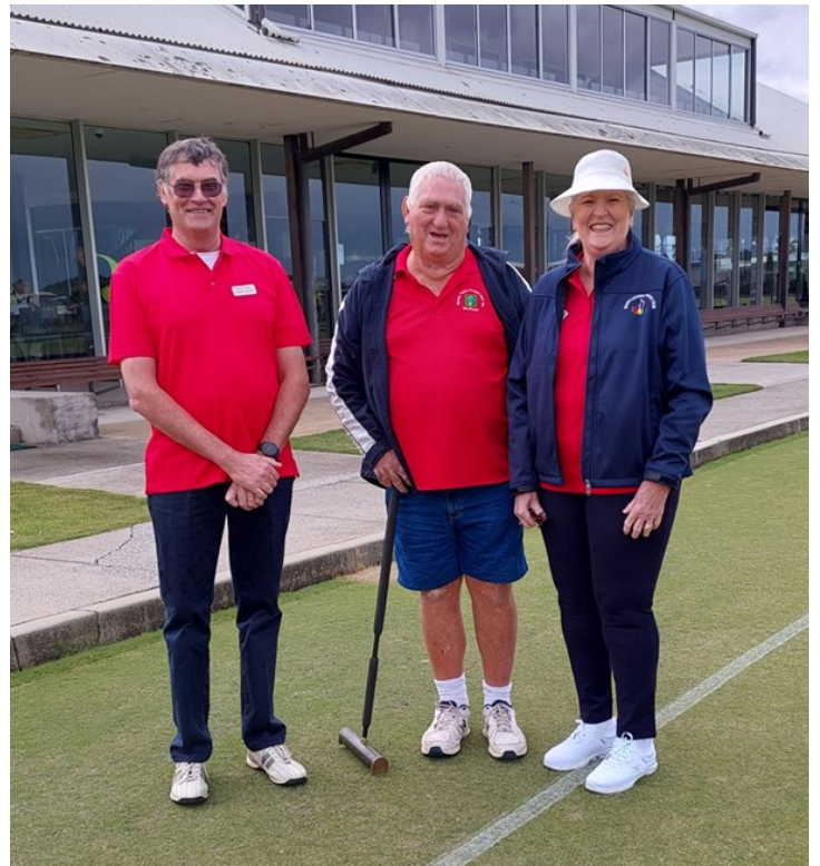
Murray Valley Region team at the Victorian Croquet Centre, Cairnlea Melbourne.