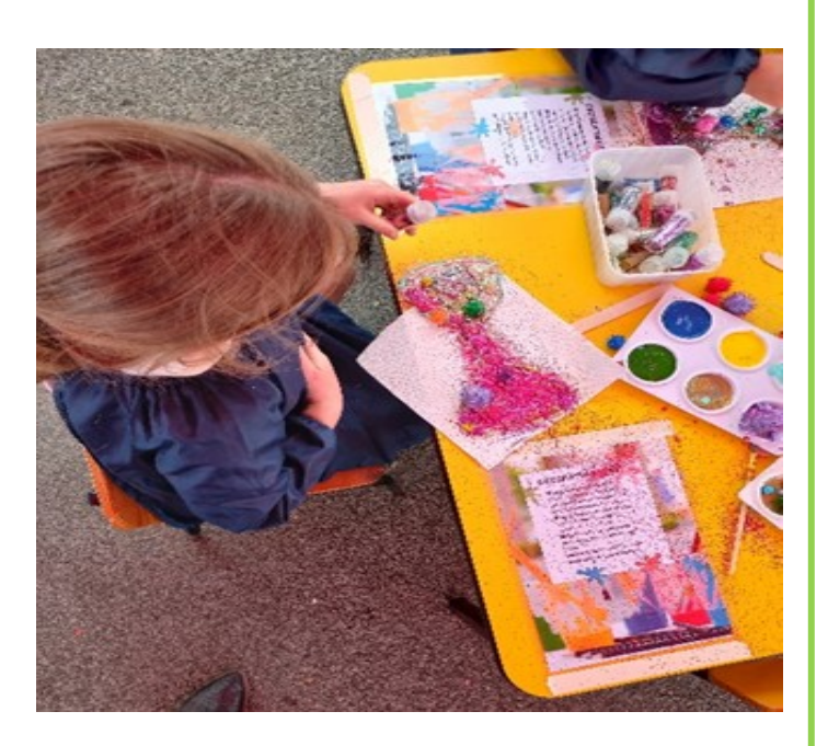
Bright and sparkly "Cup Craft" at The 2023 Boort Show