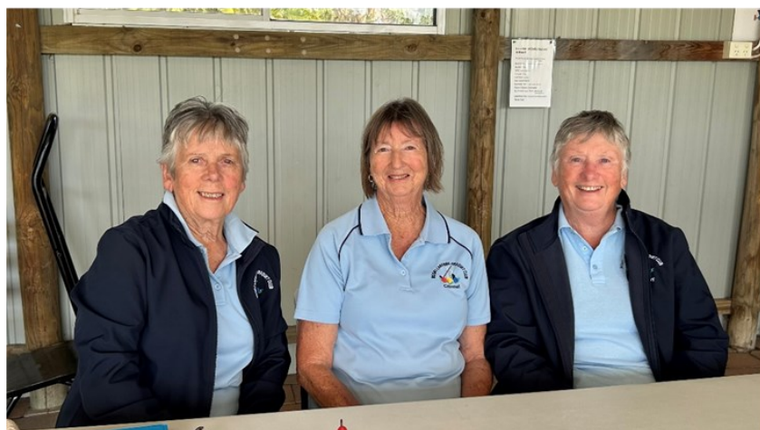
2025 Boort Lakeside Croquet Executive:

Social play will continue over the winter months at 1:00pm on Wednesdays and Saturdays, weather permitting, anyone is welcome to join us to try croquet.